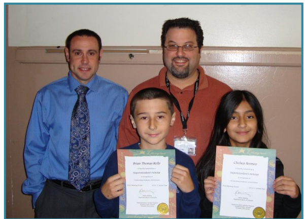
*Pictured are two of over Seventy Scholars honored.

Team members are pleased that the number of Superintendent Scholars more than doubled since the second marking period!