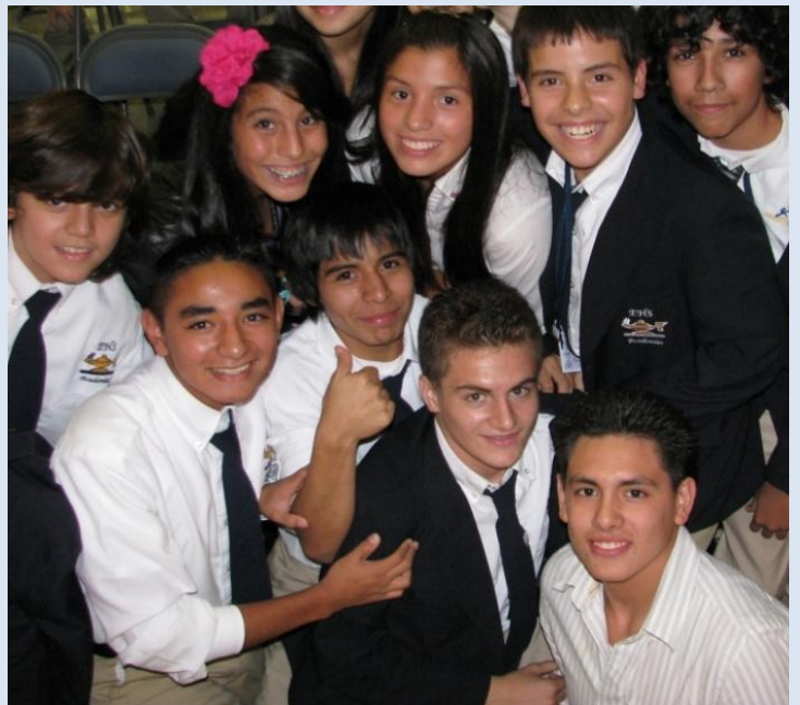
Photograph taken at 2009 Perfect Scores Award Ceremony