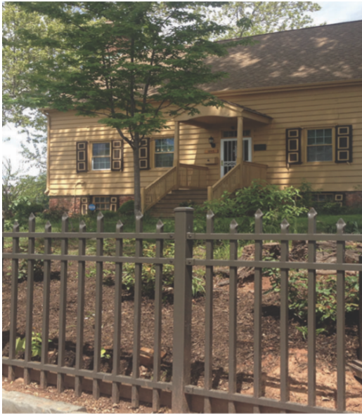
NATHANIEL BONNELL HOUSE

Come visit the Corner that History Made. We are a 4 century site.