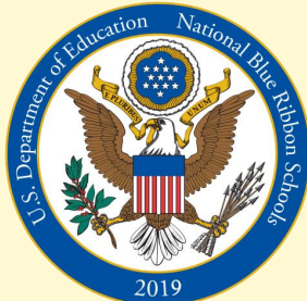
Terence C. Reilly School No. 7