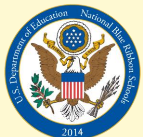
William F. Halloran School No. 22