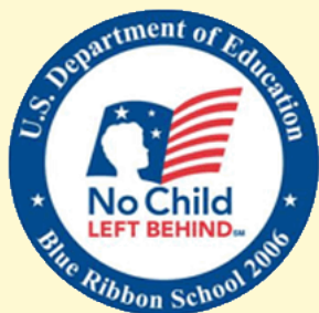
William F. Halloran School No. 22