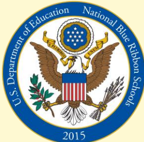
Elizabeth High School