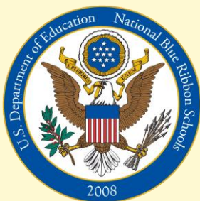
Victor Mravlag School No. 22